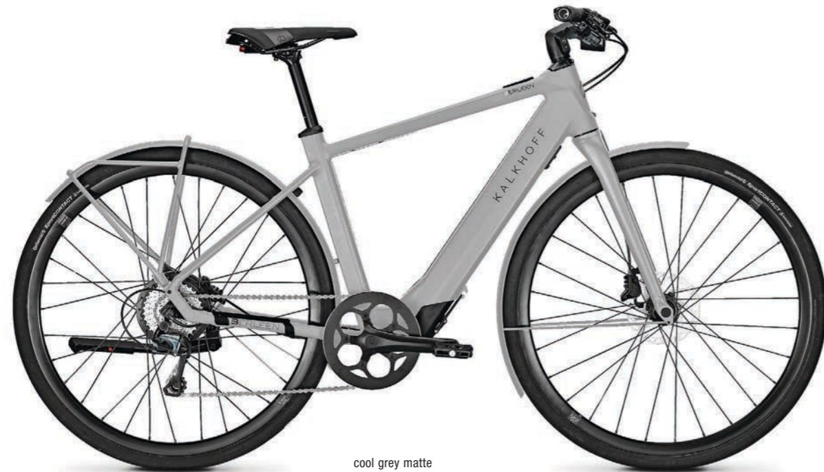
cool grey matte

MOTOR: Groove Go, 36 V / 250 W BATTERY: Groove Next Li-Ion 36V / 7AH (252Wh) / 7 Ah (252 Wh)